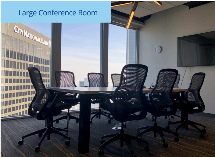
Large Conference Room